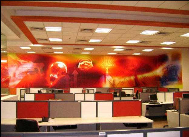
Pasting - VOI News Channel