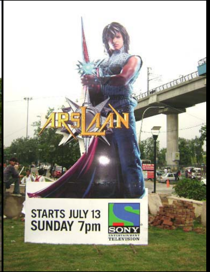
Large Format Cutouts