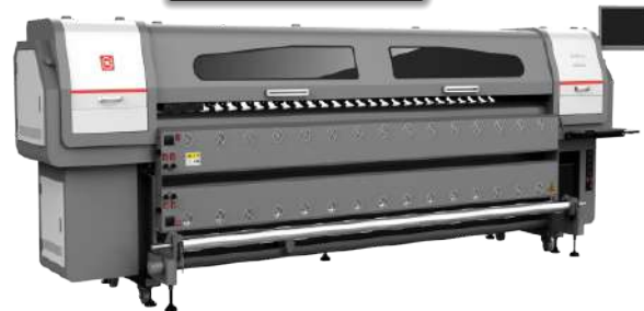
STAR FIRE 10PL